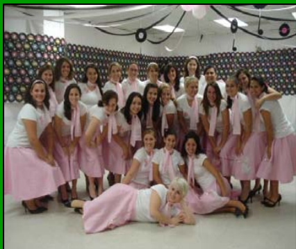
Sigma Delta Tau Sisterhood Day Formal Recruitment 2007

Will I fit it? Will I succeed academically? Will I find people with similar interests as me? Involvement with campus community can eliminate the anxiety of these common questions. More specifically, sororities and fraternities help you find your niche at the College of Charleston. In addition, they offer academic assistance, encourage involvement in other student and community organizations, open doors for numerous opportunities, and help develop your social skills.