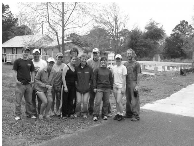
2009 MPASA Habitat Build